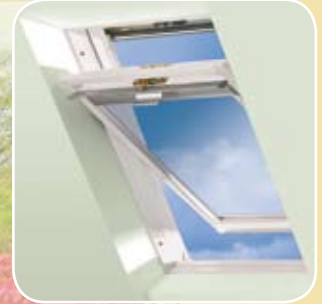
White Finish Window