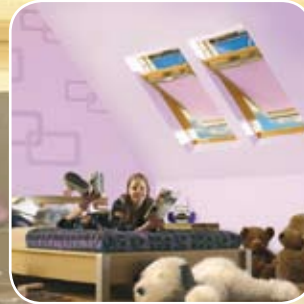
Electric Operation Windows & Blinds