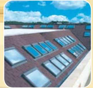
Combination Flashings & Glazing Options