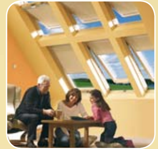
Top Hung Window