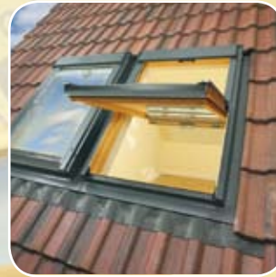
Centre Pivot Window